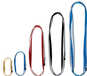
SLING 16 mm C2075