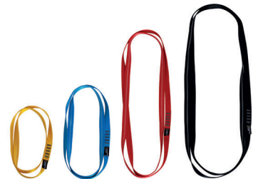
OPEN SLING 20 mm W2001