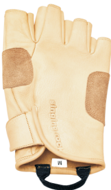
GRIPPY 3/4 C0006HH