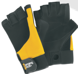
FALCONER 3/4 C0014YB