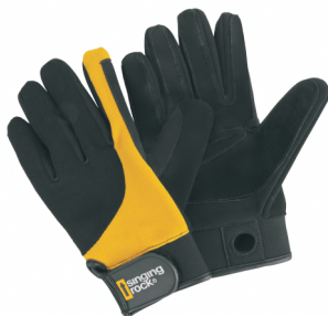
FALCONER FULL C0012YB